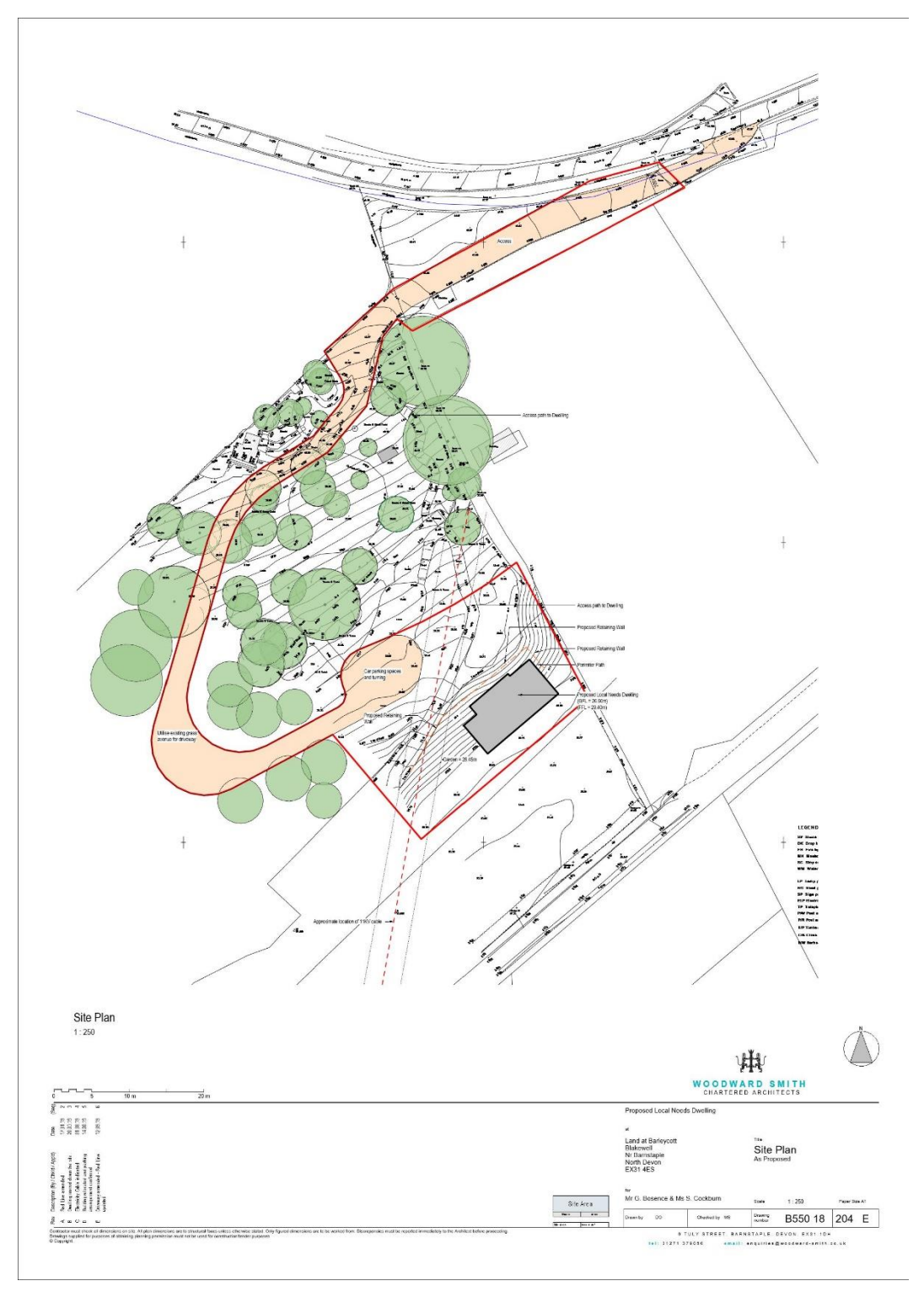
Figure 3 – Site Plan as proposed