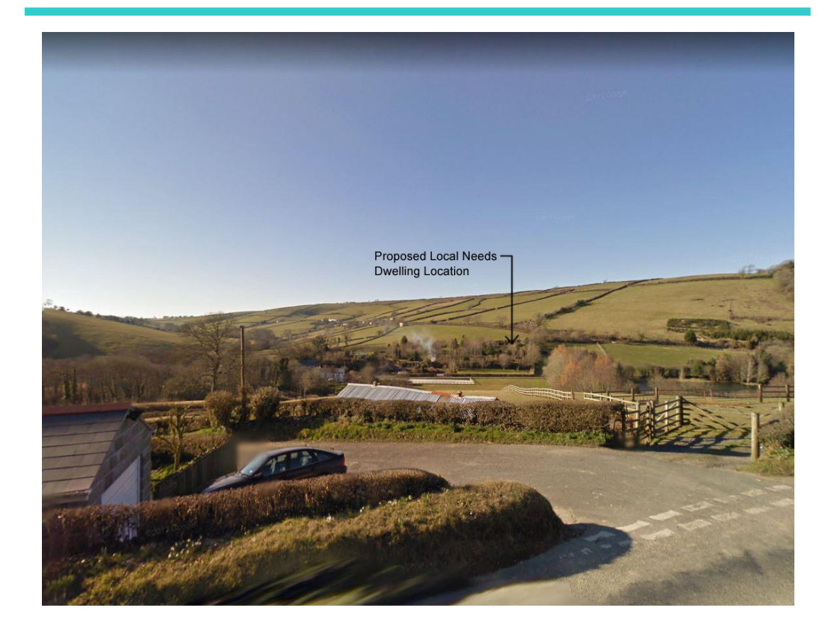
Figure 2 – View from B3230